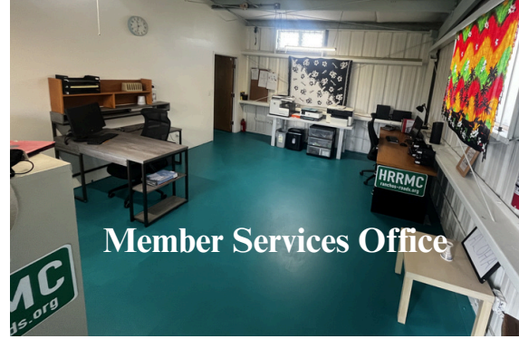
Member Services Office