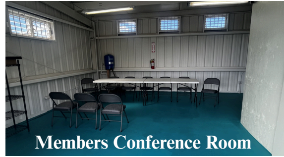
Members Conference Room